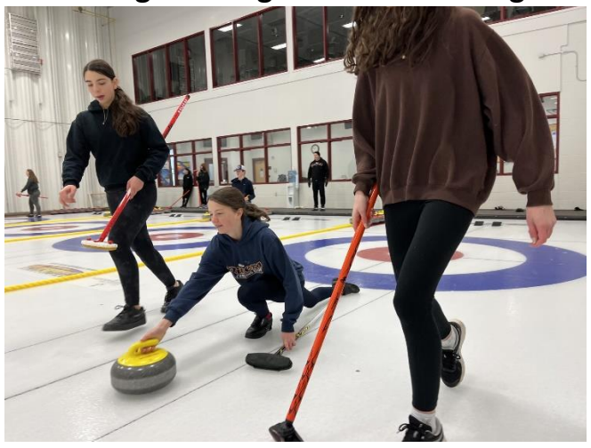
Jr. High Curling & Downhill Skiing